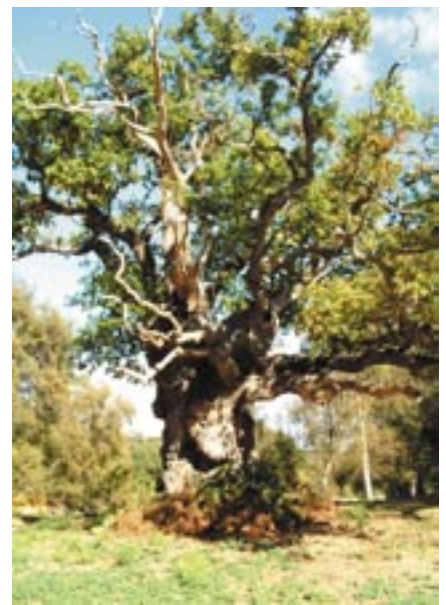
Right: one of many grand Staverton Oaks.

And then it was to the woods! I like many others was just so seriously impressed by Staverton Park. As we stood under the ancient trees a reverent hush descended upon our group, the first hush of the day I think! The facts rolled out of our guides and mostly over our heads as we just gazed in silent awe at our surroundings and slowly took in the many coincidental accidents of history that had allowed this wood to survive, pretty much in its original state since at least 1275. Hats off to the Kemble family, say I, and all power to their elbow - the woods are maintaining their luck through the ages with the present owners. Just to think - most of our landscape was like that at the time of the Conquest.